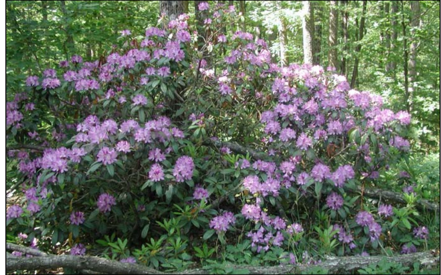
Strandja rhododendron – oriental beech forests