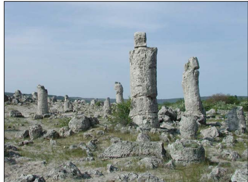
Pobiti kamani (64.A – Standing stones inland dunes)