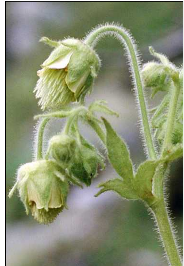
Geum bulgaricum Pancic