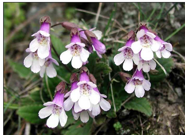
Haberlea rhodopensis Friv.