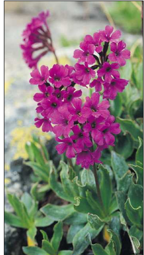
Primula deorum Velen.