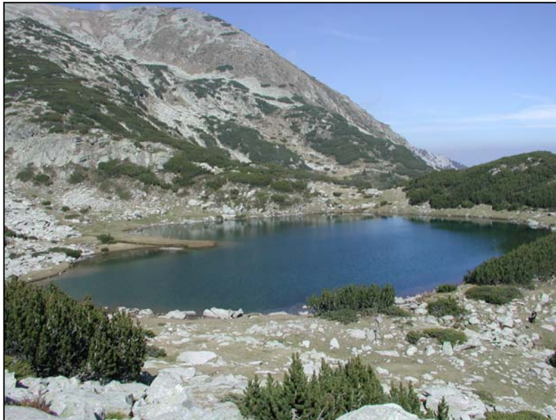
Muratovo Lake - Pirin mt.